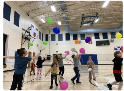
PE Badminton Fun